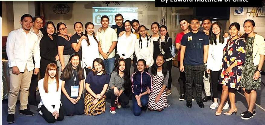
The Menorah Editorial Board, Contributors, Young Professionals and Gen-C Youth