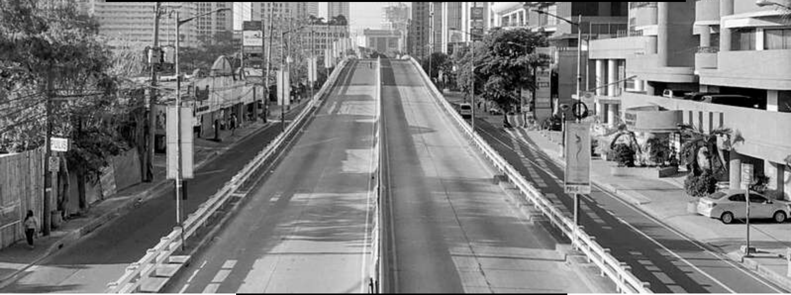
Manila's empty roads during lockdown.

If we have been reading what people are sharing in social media or watching the headlines, we may have wondered whether the world is coming to an end. The coronavirus pandemic is alarming and confusing, and fears about it are not unjustified or to be taken lightly. This plague raises serious medical, moral and safety concerns. Beyond these, it raises more fundamental questions for people of faith.