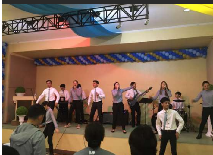
FOCIM's Praise Worship Team during THCE Bacolod

A lot of the success of the Bacolod Touching Heaven Changing Earth was also due to FOCIM’s Praise and Worship team of singers and dancers. Their high energy and masterful rendition of their numbers were not lost on those who attended the sessions, who were blessed by the anointed worship songs and dances.