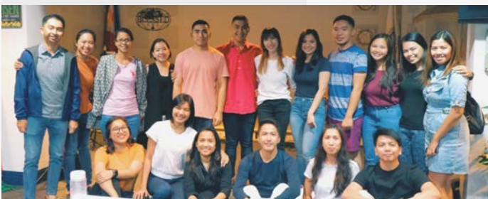
GEN-C YOUTH LEADERS

To help recall the many concepts and principles of the four topics, all attendees were treated to a friendly game of "Jeopardy". All in all, the event proved to be as productive as it was enriching. Ultimately, the camp was the perfect venue to instill the mindset for all young leaders that the best way to defend our faith is to imitate our savior, Jesus Christ.